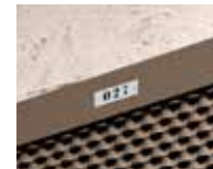
Perforated number on a steel plate