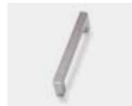
Zamak handle matt chrome