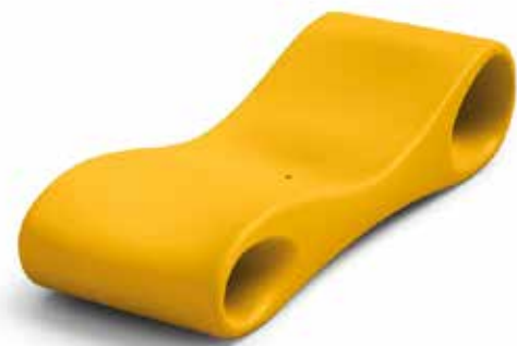
E Giallo mango