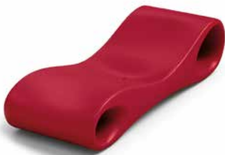
C Rosso oriente