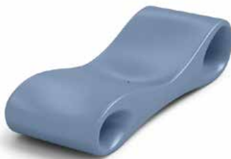
D Blu cielo