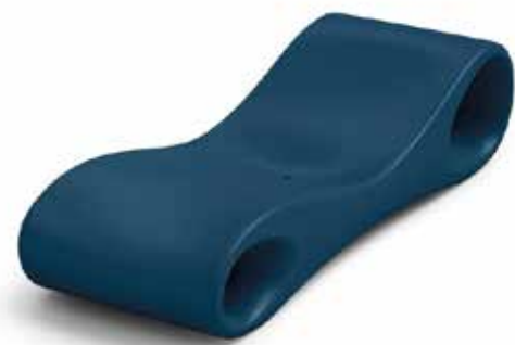
G Blue petrolio