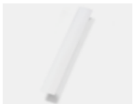
HAN 05B Zamak handle, white Dimensions W 22 mm / D 18 mm / H 158 mm