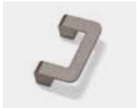
HAN 04 Zamak handle, titanium Dimensions W 50 mm / D 25,7 mm / H 80 mm