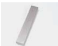
HAN 06 Aluminium handle, polished anodised Dimensions W 16mm / D 30 mm / H 198 mm