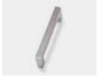
HAN 01B Zamak handle, matt chrome Dimensions W 10 mm / D 30 mm / H 106 mm