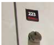
Number made of PVC