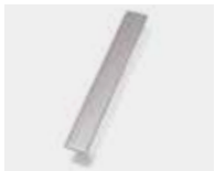
HAN 05A Zamak handle, polished chrome Dimensions W 22 mm / D 18 mm / H 158 mm