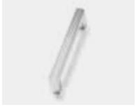
HAN 01A Zamak handle, polished chrome Dimensions W 10 mm / D 30 mm / H 106 mm