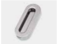
HAN 03 Recessed handle in zamak, polished chrome Dimensions W 42 mm / D 12 mm / H 106 mm