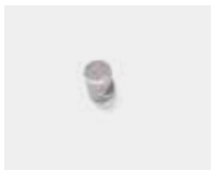
HAN 02 Zamak knob, polished chrome Dimensions ø 20 mm / D 25 mm