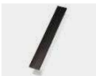
HAN 05C Zamak handle, anthracite Dimensions W 22 mm / D 18 mm / H 158 mm