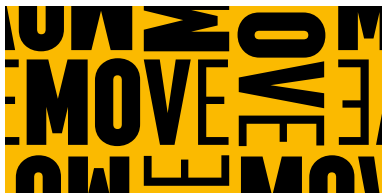
"MOVE, MOVE, MOVE" 18