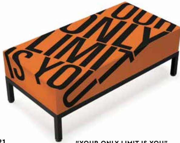
21 "YOUR ONLY LIMIT IS YOU"