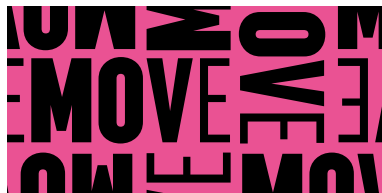
"MOVE, MOVE, MOVE" 19