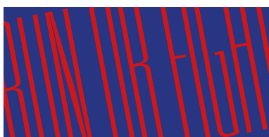
"RUN OR FIGHT" 20