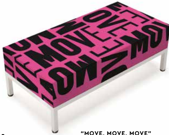
19 "MOVE, MOVE, MOVE"