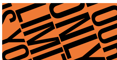
"YOUR ONLY LIMIT IS YOU" 21