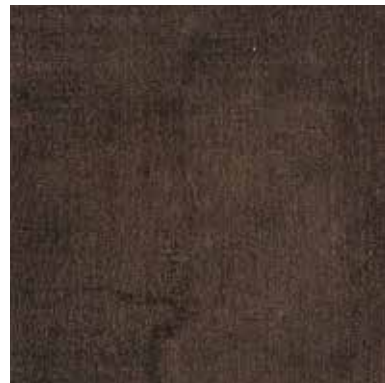
FA33 MAYA BRONZE PENELOPE