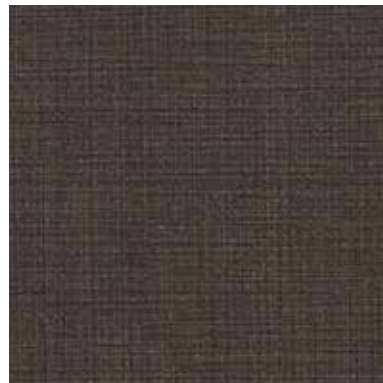
FA46 GUERRILLA PENELOPE