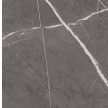
K4892 PIETRA GREY