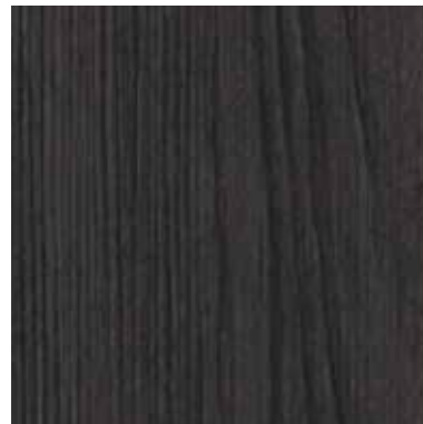
4043 NOCE ADIGE