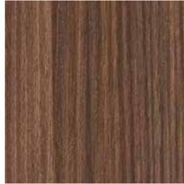
LK48 NOCE LEUCA MATRIX