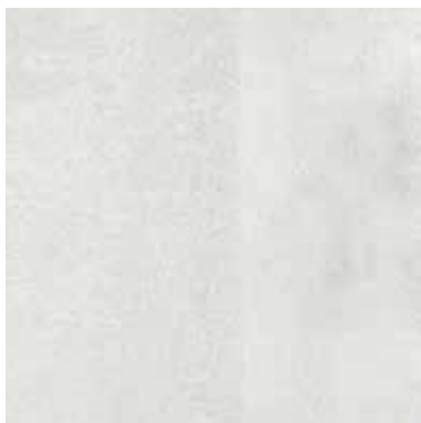
44374DP CEMENTO GRIGIO OPALE