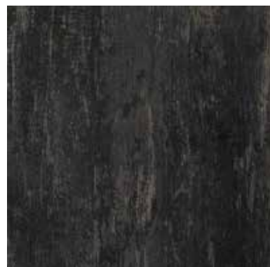
U005 URBAN IRON