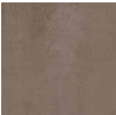
44408DP RUGGINO RAME BRONZO