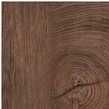
K5413RO QUERCIA ENDGRAIN COGNAC