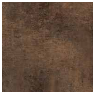
0794 PATINA BRONZE