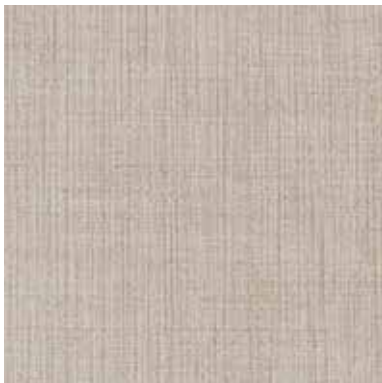
FA44 KAKI PENELOPE