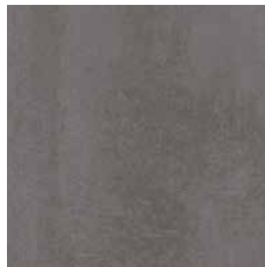
44405DP CEMENTO GRIGIO ARDESIA