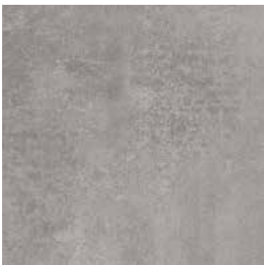
44407DP CEMENTO PLATINO