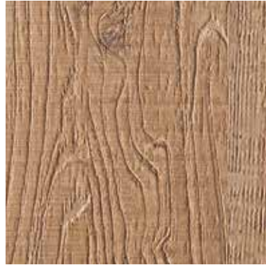
S073 ST JAMES PARK SHERWOOD