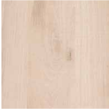
K4410AW NATIVE OAK LIGHT