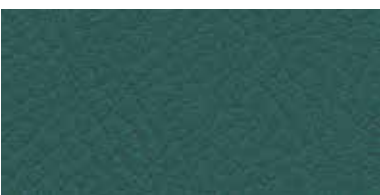
51 GREEN FOREST