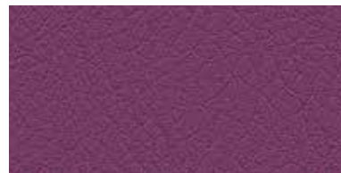
21 ANTIQUÉ PINK