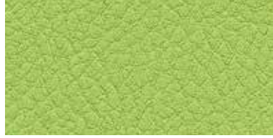
27 LIGHT GREEN