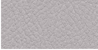
600 LIGHT GREY