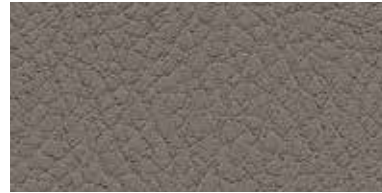
603 DARK GREY